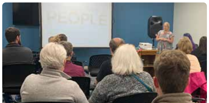
To celebrate Recovery Month in September, First Step Recovery put up a Recovery Wall and hosted a community screening of the documentary “The Anonymous People.”

“I felt peace of mind following the sessions. Having a plan is huge!” – Financial Resource Center client