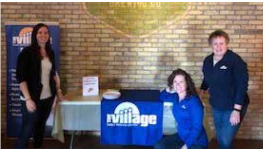
Village staff in St. Cloud participated in a fundraising event called Tending for a Cause on Nov. 3.