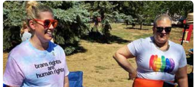
The Village sponsored booths at Pride in the Park events in Minot, St. Cloud, and Fargo (pictured).