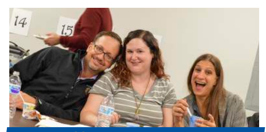
FARGO staff enjoy the many samplings at a chili cookoff.

The ST. CLOUD OFFICE started a Dissociative Coping group for adults with severe PTSD.