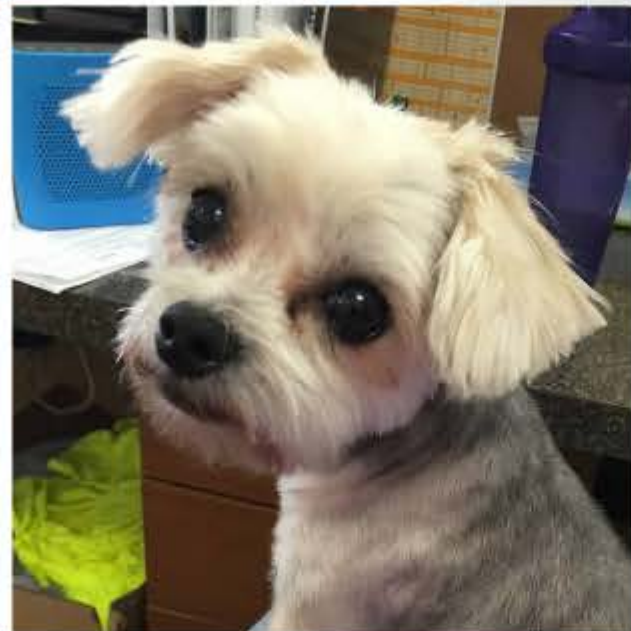
Lulu is a 10.5 year old Morkie with a larger than life attitude.