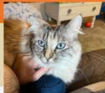
Fiona our Siamese mix is 6. She is both indoor and outdoor.