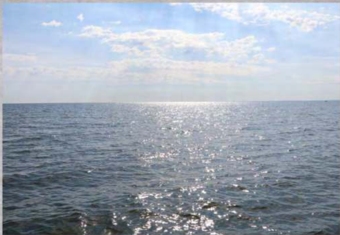
Lake Superior, Duluth, MN