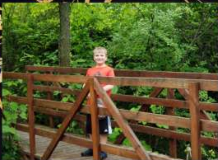
Fishing off a dock on one of our trips.

Hiking is so fun since you never know what you will find around the corner.